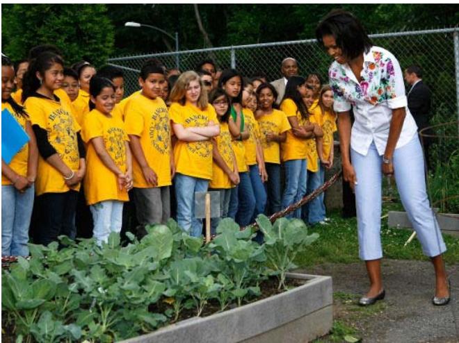
First Lady Obama at Bancroft Elementary School

factors in the physical environment;” opening them can directly increase access to recreation space, especially outdoor green spaces, translating into increased opportunities to participate in physical activities. In searching for ways to increase healthy physical and social habits of both children and adults, public health advocates have identified these public infrastructure assets—public school buildings and grounds—as places that can and should play an important role in increasing physical activity not only among children and adolescents but also contributing to healthier communities. 18 In some communities neighborhood schools may be one of few places where children can be involved in active play.