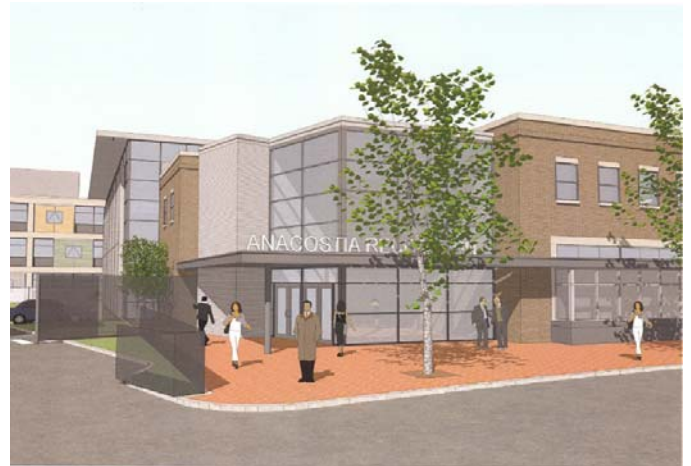
Savoy and Thurgood Marshall Sports and Learning Center

We propose that a fundamental shift is needed in how we view our public school buildings and grounds; a new social contract for the use of our public school infrastructure.