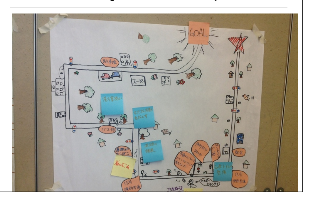
Phase 2: Making Sense of the City