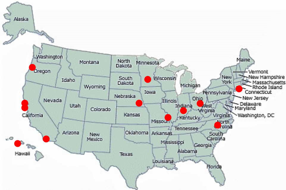
Figure 2: Map of Eleven Featured Efforts

The eleven efforts have been categorized by their scope, from micro-level neighborhood changes to broader citywide and countywide changes, and finally more macro-level state changes. The eleven are also geographically diverse, spanning the country from coast to coast (see Figure 2).