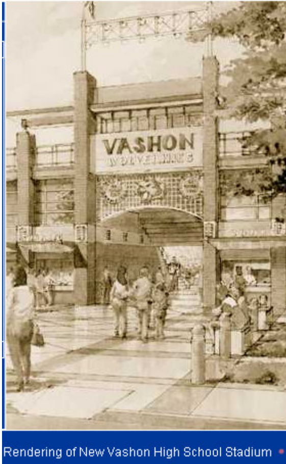
Rendering of New Vashon High School Stadium

A combination of outspoken community members, the Vice President of a Foundation and a visionary business leader brought the Compact together. The Compact was a public-private partnership of the St. Louis Public Schools, St. Louis Public Schools Foundation, the Vashon/JeffVanderLou Initiative and numerous corporate, philanthropic, and cultural partners. A Governing Board oversaw the Compact. This board was co-chaired by