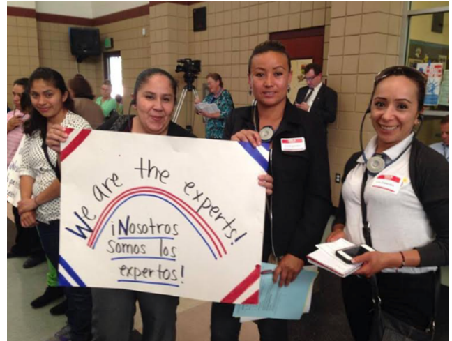
Youth-led school board candidates forum in Richmond.

With the 2013 introduction of the Local Control Funding Formula (LCFF), the West Contra Costa School District, Healthy Richmond, the City of Richmond, and other stakeholders have been strategizing around how the LCFF can benefit underserved students through the implementation of a Full Service Community School model (FSCS). The district submitted an Local Control Accountability Plan (LCAP) for the 2014-15 school year, and is currently drafting the 2015-17 which identified 2014-15 LCAP actions.