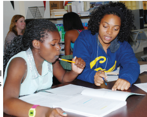
Richmond ESC coordinates WriterCoach Connection, a writing tutoring program, at Richmond and Kennedy high schools. Source: http://www.writercoachconnection.org/

Nearly half of all West Contra Costa Unified School District (WCCUSD) schools are located in the City of Richmond and many Richmond students benefit immensely from the kinds of services offered in a community school. Now is an especially urgent time for high quality community schools implementation given the Richmond Promise, Local Control Funding Formula, and WCCUSD community schools policies. The Richmond Promise 2 guarantees scholarships to Richmond residents who graduate from a WCCUSD high school to pursue higher education. Richmond youth must be college-ready to take advantage of this incredible opportunity. As of now, youth in Richmond schools graduate from high school at lower rates than the rest of the district, and those who do graduate are less likely to have UC or CSU requirements than the average WCCUSD graduate. The city of Richmond is poised to support WCCUSD in providing the kind of support that can buoy student achievement. Richmond is empowered by its General Plan, a reflection of community will, to “support West Contra Costa Unified School District and other institutions in providing higher quality K-12 learning environments for children and youth.” 3 Furthermore, Richmond is prepared to lend expertise given a history of piloting community schools initiatives in local elementary schools.