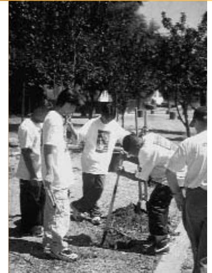
left: In the final design of the McClymonds Mini Park, a permanent alleé of trees is transformed by each class, which plants a tree for each freshman in a planting bed (below) and removes them four years later as seniors. The alleé becomes a chronicle of growth and change of the school.