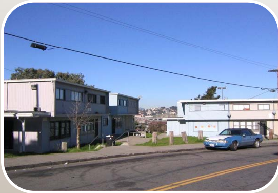
John Stewart Co.